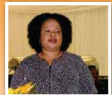
Dikeledi Mmetle, mayor of the Greater Tzaneen Municipality.