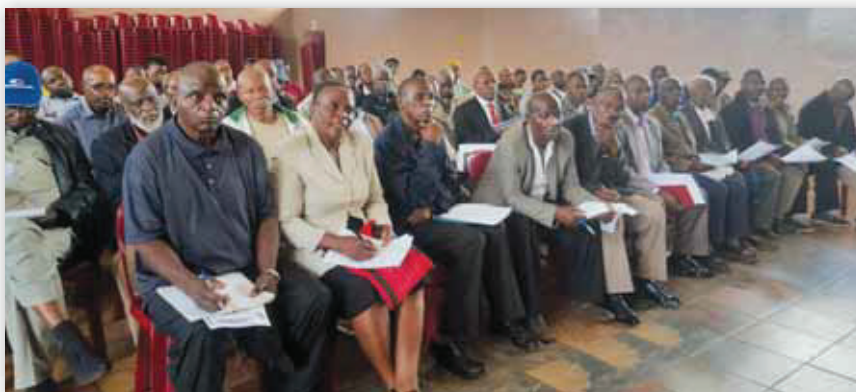
Mango farmers welcoming guest speakers.